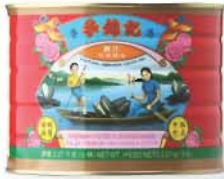
① Premium Oyster Flavored Sauce 舊庄特級蠔油 6 x 5 lb. can