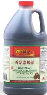
⑦ Vegetarian Mushroom Flavored Stir-Fry Sauce 香菇素蠔油 6 x 5 lb. 5 oz. plastic pail