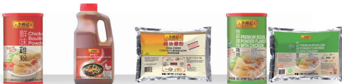
① Chicken Bouillon Powder 鮮味雞粉 12 x 2 lb. 3 oz. can