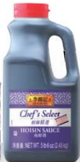
④ Chef's Select Hoisin Sauce 廚師精選海鮮醬 6 x 5 lb. can 6 x 5 lb. 6 oz. plastic pail