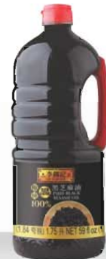
⑥ Pure Black Sesame Oil 極純黑芝麻油 6 x 59 fl.oz. (1.75 L) plastic pail