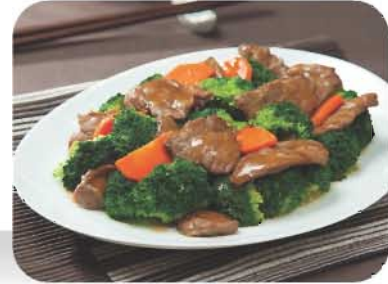
Broccoli Beef with Oyster Sauce 蠔油西蘭花炒牛肉