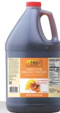
⑩ Sauce for Orange Chicken 香橙雞醬 4 x 10 lb. plastic pail