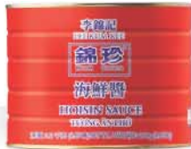
① Kum Chun Brand Hoisin Sauce 錦珍海鮮醬 6 x 4.85 lb. can