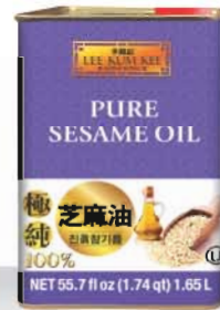
⑤ Pure Sesame Oil 極純芝麻油 10 x 55.7 fl.oz. tin can