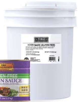
③ Gluten Free Hoisin Sauce 無麩質海鮮醬 6 x 5 lb. can 1 x 51 lb. plastic pail