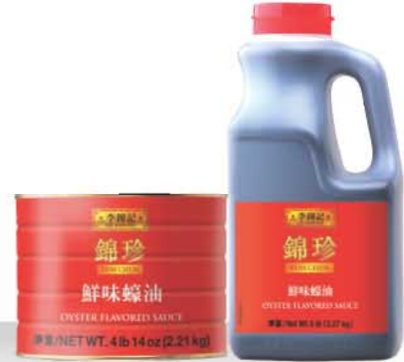
⑤ Kum Chun Oyster Flavored Sauce 錦珍鮮味蠔油 6 x 4 lb. 14 oz. can 6 x 5 lb. plastic pail