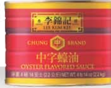
② Chung Brand Oyster Flavored Sauce 中字蠔油 6 x 4 lb. 14 oz. can