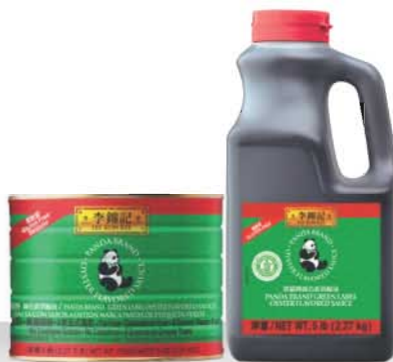
④ Panda Brand Green Label Oyster Flavored Sauce 熊貓牌綠色新裝蠔油 6 x 5 lb. can 6 x 5 lb. plastic pail