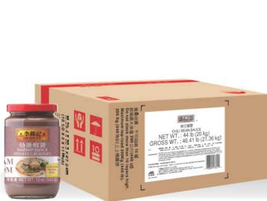
⑯ Shrimp Sauce (Finely Ground) 幼滑蝦醬 12 x 12 oz. glass jar 1 x 44.09 lb. bag in box