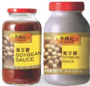
⑭ Soybean Sauce 黃豆醬 6 x 28 oz. glass jar 6 x 2 lb. 3 oz. plastic pail