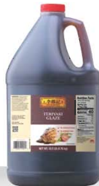
⑨ Teriyaki Glaze 燒烤(淋)醬 4 x 10 lb. 8 oz. plastic pail