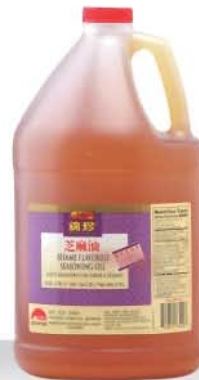
⑨ Kum Chun Sesame Flavored Seasoning Oil 錦珍芝麻油 4 x 1 gal. plastic pail