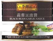
① Black Bean Garlic Sauce 蒜蓉豆豉醬 6 x 5 lb. can