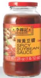
⑮ Spicy Soybean Sauce 辣黃豆醬 6 x 28 oz. glass jar