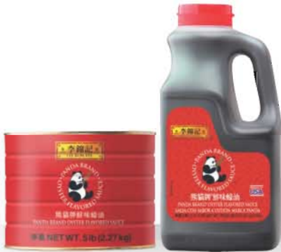
③ Panda Brand Oyster Flavored Sauce 熊貓牌鮮味蠔油 6 x 5 lb. can 6 x 5 lb. plastic pail