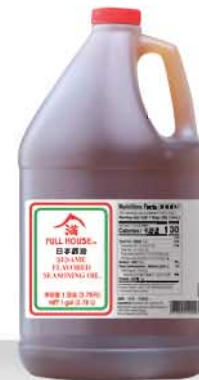
⑩ Full House Sesame Flavored Seasoning Oil 滿日本麻油 4 x 1 gal. plastic pail