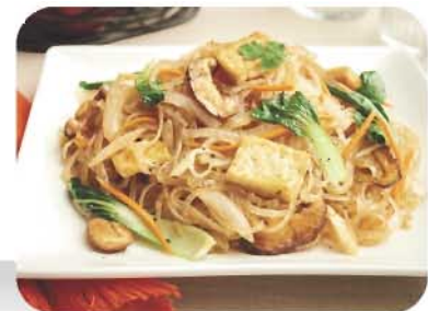
Glass Noodle with Vegetarian Stir-Fry Sauce 素蠔油炒面