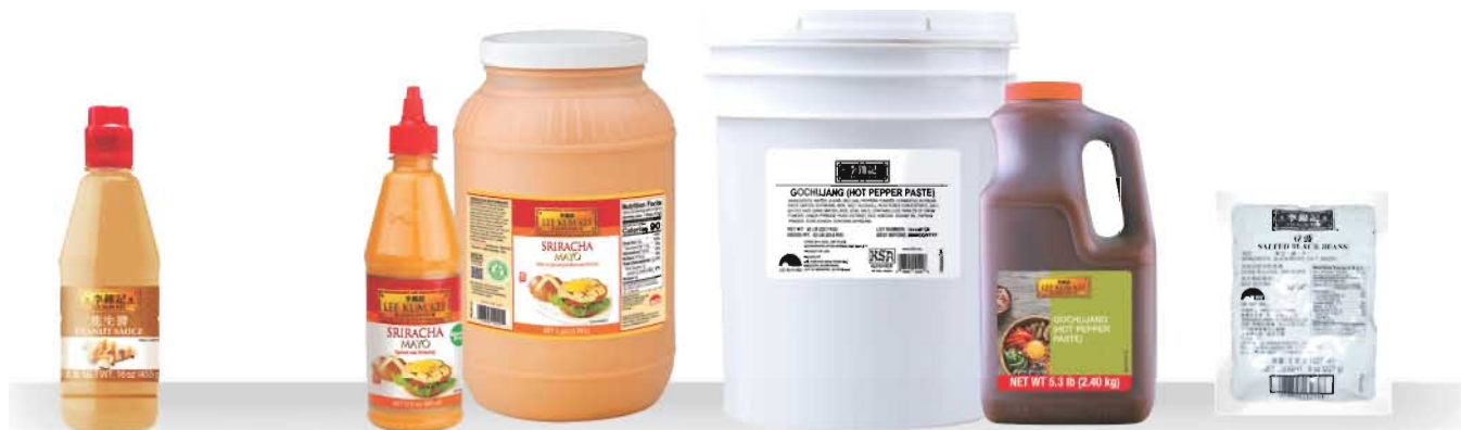
① Peanut Sauce 花生醬 12 x 16 oz. PET bottle