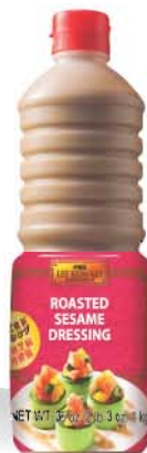
⑰ Roasted Sesame Dressing 焙煎芝麻沙律醬 6 x 2 lb. 3 oz. plastic pail