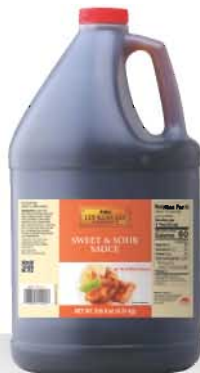
⑧ Sweet & Sour Sauce 甜酸醬 4 x 9 lb. 8 oz. plastic pail