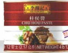
③ Chu Hou Paste 柱侯醬 6 x 4 lb. 12 oz. can