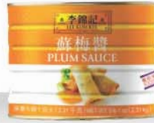
⑫ Plum Sauce 蘇梅醬 6 x 5 lb. 1 oz. can