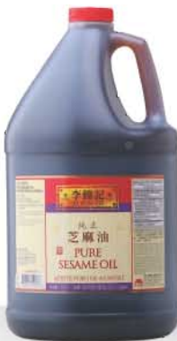
⑦ Pure Sesame Oil 純正芝麻油 4 x 1 gal. plastic pail