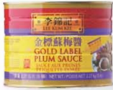
⑪ Gold Label Plum Sauce 金標蘇梅醬 6 x 5 lb. can