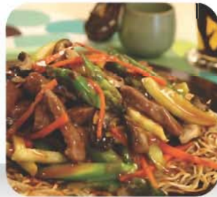
Pan Fried Noodles with Hoisin Sauce 海鮮醬鐵板炒麵