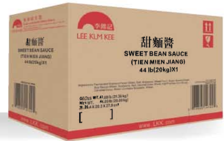
⑱ Sweet Bean Sauce 甜麵醬 1 x 44 lb. bag in box