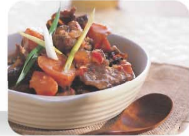
Stewed Beef with Soybean Sauce 黃豆醬燜牛肉