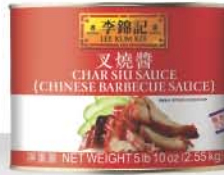
② Cha Siu Sauce (Chinese Barbecue Sauce) 叉燒醬 6 x 5 lb. can