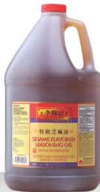
⑧ Sesame Flavored Seasoning Oil 特級芝麻油 4 x 1 gal. plastic pail