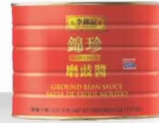
⑬ Kum Chun Brand Ground Bean Sauce 錦珍磨豉醬 6 x 5 lb. can