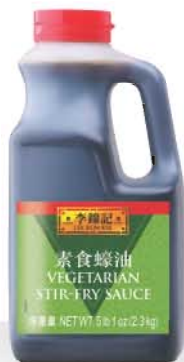
⑥ Vegetarian Stir-Fry Sauce 素食蠔油 6 x 5 lb. 1 oz. plastic pail