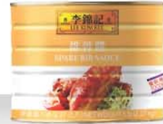
④ Spare Rib Sauce 排骨醬 6 x 5 lb. can